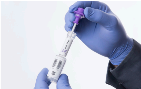
1. Collect sample swabs

The user follows a series of simple steps to initiate a run: