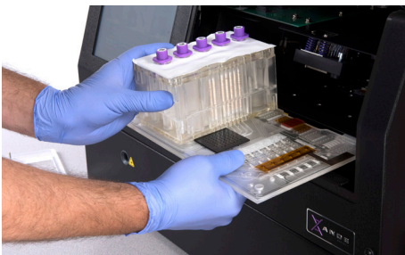
4. Load the Chip into ANDE