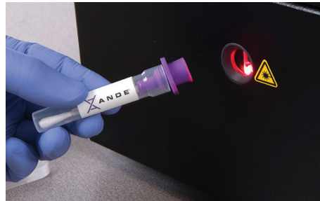
2. Input sample ID and read RFID tag