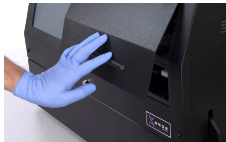
5. Close the door

After the user closes the door the ANDE system automates the remainder of the testing process. The correct protocol is chosen and the samples processed. Following data collection, the integrated Expert System processes the raw data, assigns allele calls and interprets the DNA ID. At the end of the run the user removes the Chip and can immediately see an assessment of the run results.